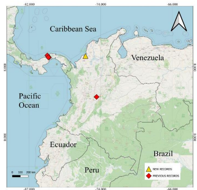
Figure 4. Known distribution of Descanso peregrinus Chickering, 1946, with a new record from Córdoba Department, Colombian Caribbean.

Comments. Specimens were collected from the foliage of shrubs of the genus Eugenia P. Micheli ex L. (Myrtaceae), located in a fragment of tropical dry forest at 77 m alt., in the rural area of Purísima, Córdoba, in the Colombian Caribbean (Fig. 4). Within this microhabitat, they were found in association with other myrmecomorph jumping spiders of the genera Sarinda G. W. Peckham & E. G. Peckham, 1892, and Sympolymnia Perger & Rubio, 2020.