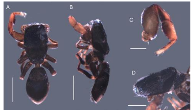
Figure 2. Descanso peregrinus Chickering, 1946, from Purísima, Córdoba: A, male, dorsal view. B, male, lateral view. C, leg I. D, Carapace, lateral view. Scale bar: A–B= 1 mm; C–D= 0.5 mm.

Material examined. 2 ♂, COLOMBIA: Córdoba: Purísima, 09°18'06.0"N, 075°41'54.8"W, 09-VIII-2022; L.A. Suárez Martínez leg. (LEUC; OARA–221).